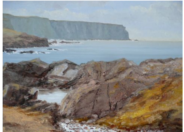
Malinmore Head from Garveross Glencolmcille, Co. Donegal Oil on hardboard 16" x 12" Catalogue no: 05.16