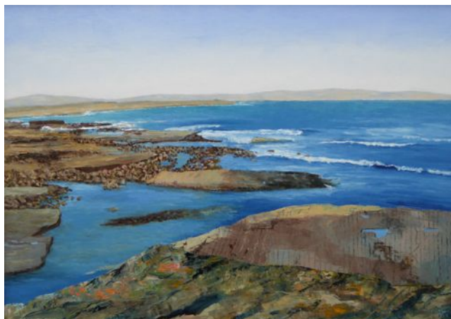
View from Downpatrick Head, Co. Mayo Oil on hardboard 22" x 16" Catalogue no: 06.17