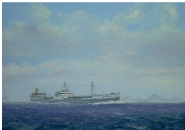
S.S. Irish Hawthorn 1958 – 1965 Oil on hardboard 22" x 16" Catalogue no: 05.06