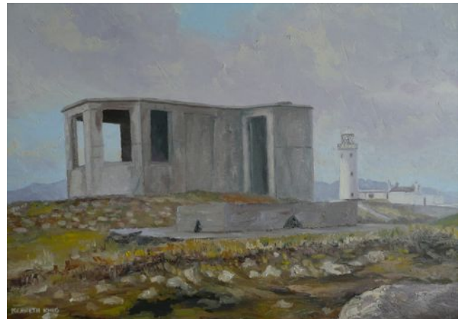
Remains of L.O.P. 79, Fanad Head, Co. Donegal Coast Watching Service 1939 – 1945 Oil on hardboard 16" x 12" Catalogue no: 03.13