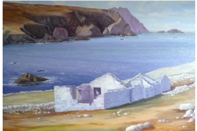
"Imionn na daoine ach fanann na cnoic" Port, Co. Donegal Oil on hardboard 30" x 26" Catalogue no: 07.13