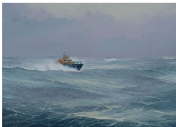
R.N.L.B. Myrtle Maud – Arranmore Lifeboat Oil on hardboard 22" x 16" Catalogue no: 17.08