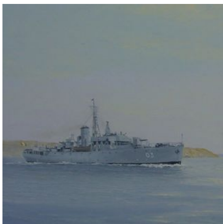
L.E. Cliona, Irish Navy 1947 – 1970 Oil on hardboard 11" x 11" Catalogue no: 22.07