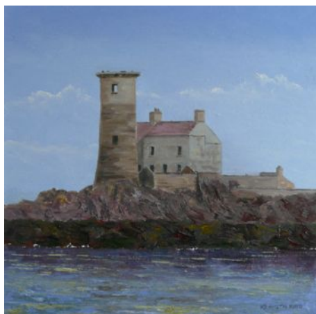
Disused lighthouse on West Maiden, Co. Antrim Oil on hardboard 11" x 11" Catalogue no: 09.15