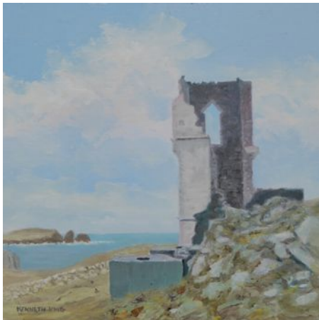
Remains of old coastguard station, Teelin, Co. Donegal, c.1980s Oil on hardboard 11" x 11" Catalogue no: 09.17