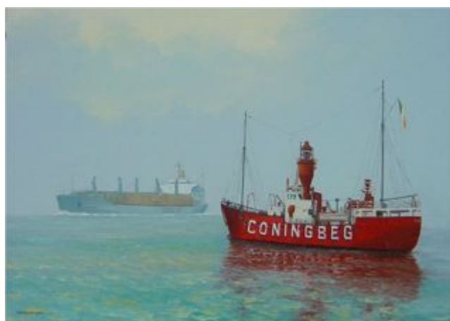
Cormorant on Coningbeg Station, c.1979 Oil on hardboard 28" x 18" Catalogue no: 05.07