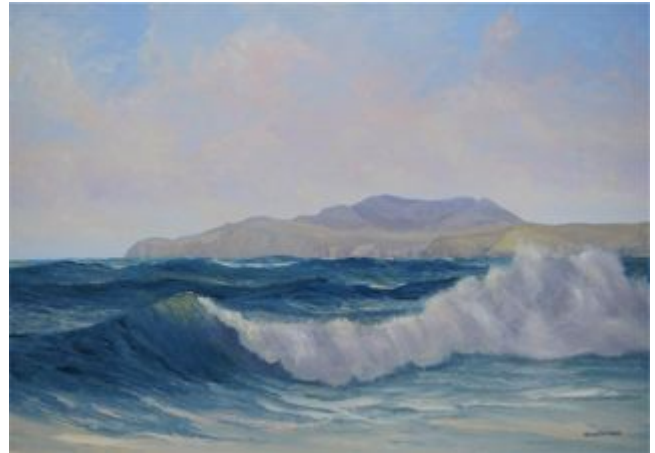
Sliabh a'Liag, Co. Donegal Oil on hardboard 28" x 18" Catalogue no: 27.10