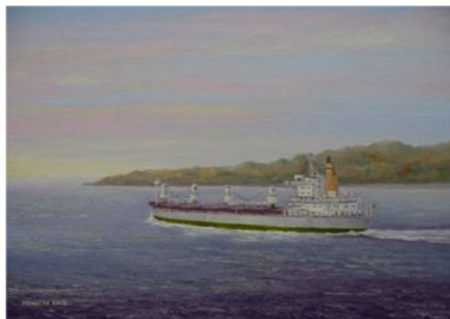
M.V. Irish Elm (3) 1968 – 1979 Oil on hardboard 16" x 12" Catalogue no: 26.09