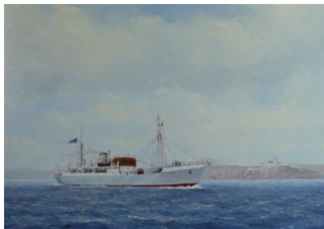
I.L.V. Isolda 1953 – 1976 Oil on hardboard 22" x 16" Catalogue no: 20.10