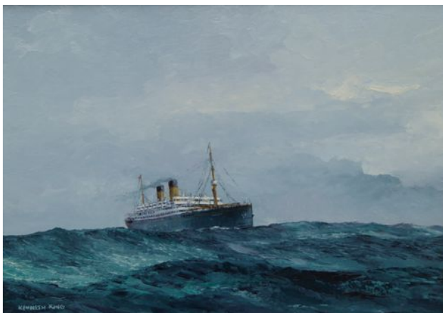
S.S. Laurentic (AMC 1939 – 1940) Torpedoed off Bloody Foreland, Donegal 03.11.1940 Oil on hardboard 16" x 12" Catalogue no: 02.17