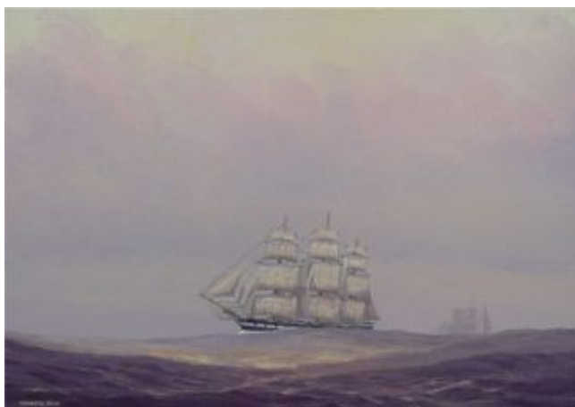
Ship Hibernia of Belfast Oil on hardboard 22" x 16" Catalogue no: 39.08