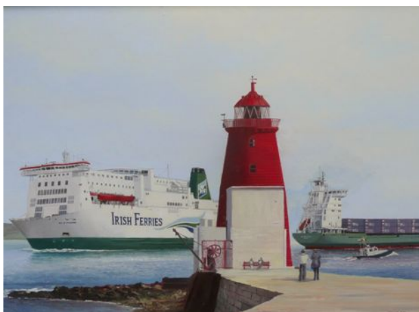
M.Vs Isle of Inishmore and Arklow Castle Oil on hardboard 30" x 22" Catalogue no: 24.99