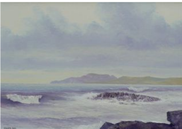
View from St. John's Point, Co. Donegal Oil on hardboard 22" x 16" Catalogue no: 14.09