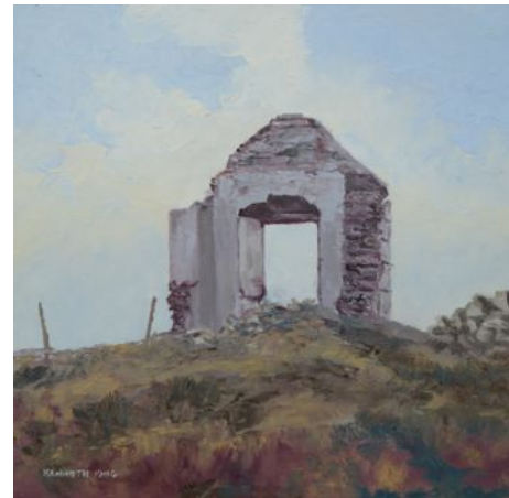
Old coastguard lookout remains, Teelin, Co. Donegal Oil on hardboard 11" x 11" Catalogue no: 08.17