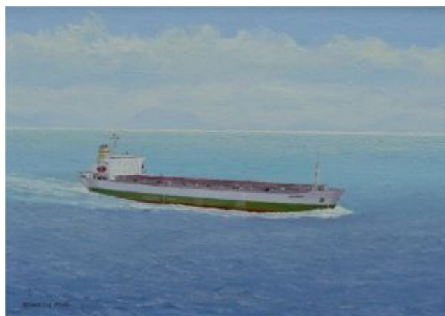
M.V. Irish Spruce (3) 1982 – 1984 Oil on hardboard 16" x 12" Catalogue no: 17.09