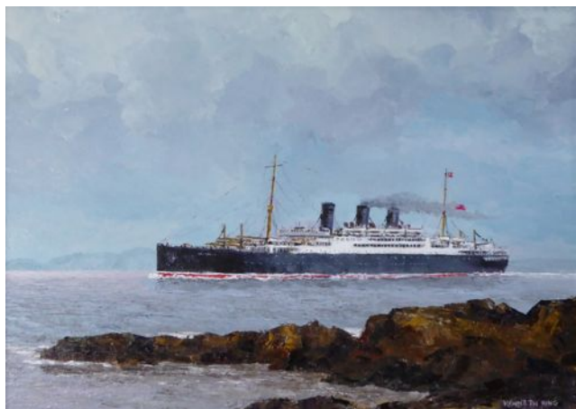
T.S.S. Transylvania (AMC 1939 – 1940) Torpedoed off Inishtrahull, Donegal, 10.08.1940 Oil on hardboard 16" x 12" Catalogue no: 03.17