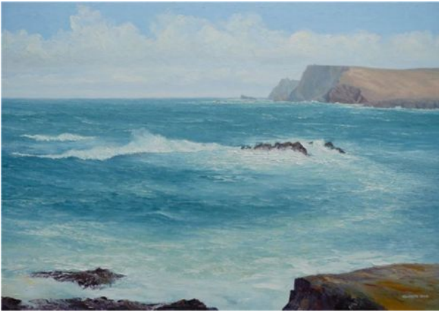
Glencolmcille Seascape, Co. Donegal Oil on hardboard 28" x 18" Catalogue no: 02.11