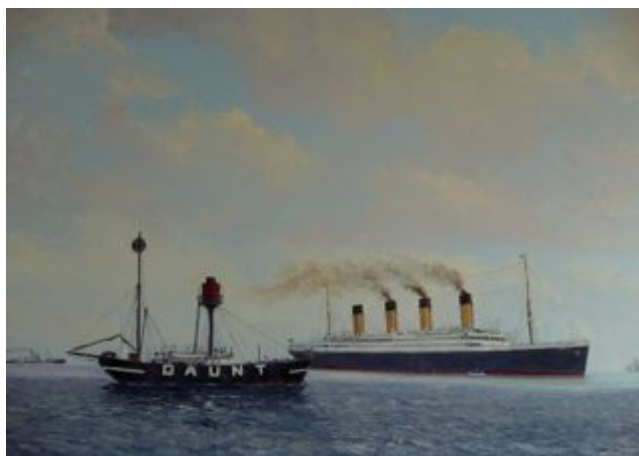
R.M.S. Titanic disembarking pilot off the Daunt Lightvessel, 11th April 1912 Oil on hardboard 28" x 18" Catalogue no: 21.11