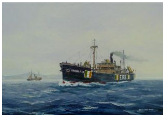
S.S. Irish Fir 1941 – 1949 Oil on hardboard 16" x 12" Catalogue no: 05.09