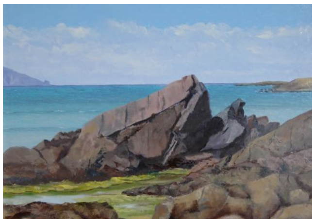
Along the shore near Rosbeg, Co. Donegal Oil on hardboard 16" x 12" Catalogue no: 09.16