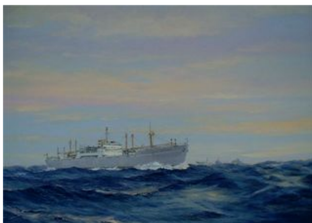
M.V. Irish Maple 1957 – 1968 Oil on hardboard 24" x 16" Catalogue no: 29.03