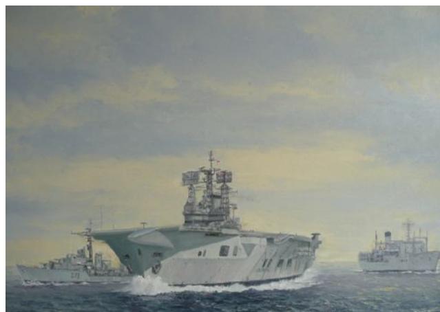
HMS Ark Royal with HMS Cavalier and RFA Lyness in company, 1970 Oil on hardboard 28" x 18" Catalogue no: 01.13