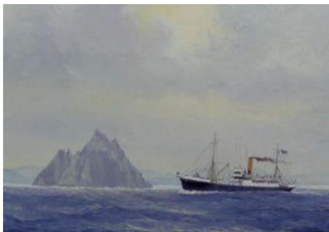
I.L.V. Isolda 1928 – 1940 Oil on hardboard 22" x 16" Catalogue no: 14.10