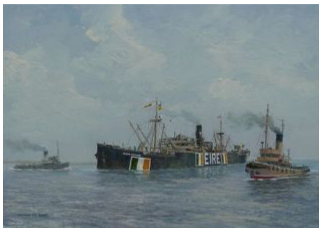
S.S. Irish Poplar 1941 – 1949 Oil on hardboard 16" x 12" Catalogue no: 18.09