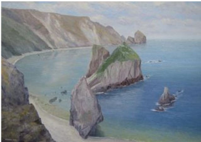
The Claddagh Mor Glenlough, Glencolmcille, Co. Donegal Oil on hardboard 28" x 18" Catalogue no: 19.11