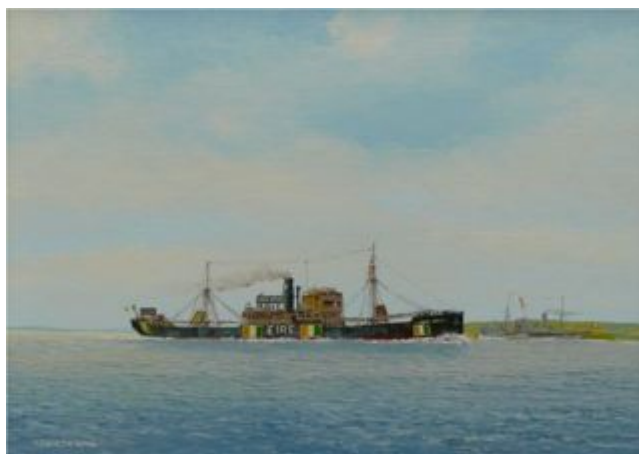
S.S. Irish Spruce 1942 – 1949 Oil on hardboard 16" x 12" Catalogue no: 36.08