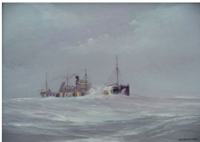
S.S. Irish Willow 1941 – 1946 Oil on hardboard 16" x 12" Catalogue no: 25.09