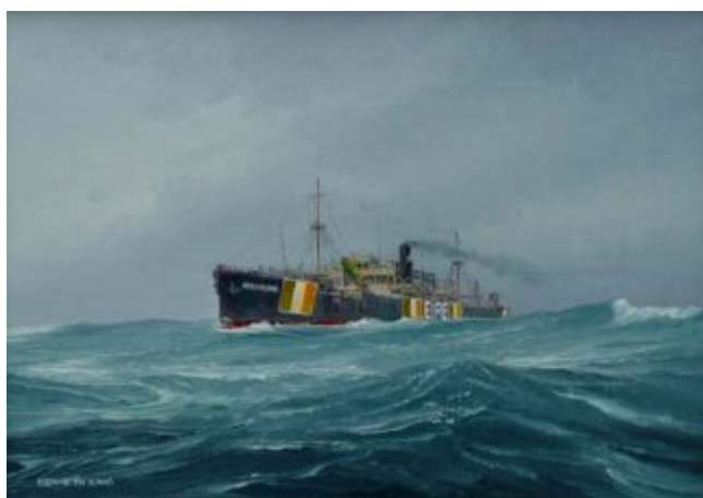
S.S. Irish Cedar 1943 – 1945 Oil on hardboard 16" x 12" Catalogue no: 32.08