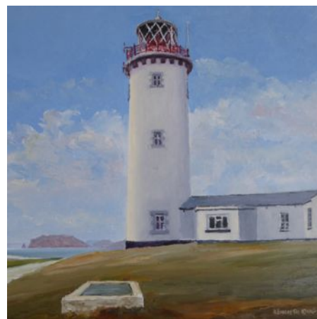
Fanad Head Lighthouse, Co. Donegal Oil on hardboard 11" x 11" Catalogue no: 11.16