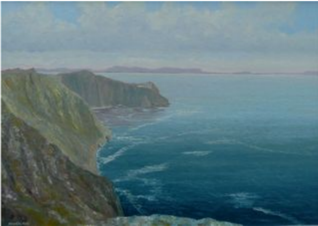
View from Sliabh a'Liag, Co. Donegal Oil on hardboard 28" x 18" Catalogue no: 11.08