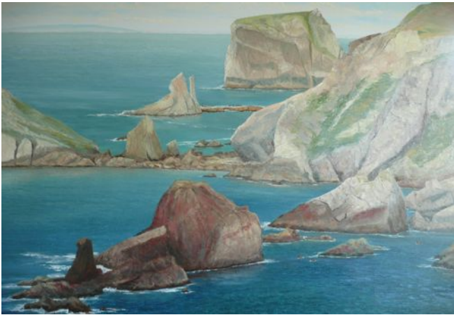
Sea Sculpture, Port to Tormore, Co. Donegal Oil on hardboard 30" x 26" Catalogue no: 09.13