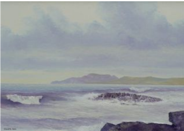
View from St. John's Point, Co. Donegal Oil on hardboard 22" x 16" Catalogue no: 14.09