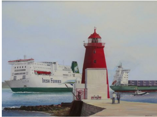
M.Vs Isle of Inishmore and Arklow Castle Oil on hardboard 30" x 22" Catalogue no: 24.99