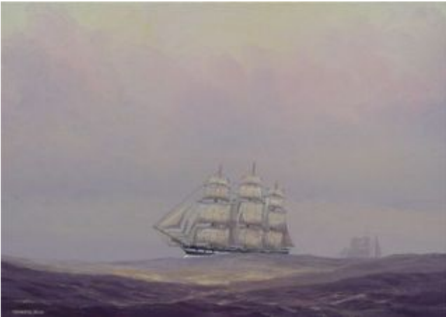
Ship Hibernia of Belfast Oil on hardboard 22" x 16" Catalogue no: 39.08