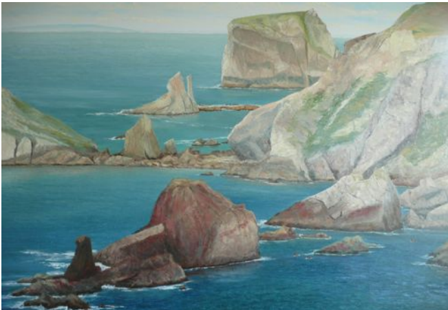
Sea Sculpture, Port to Tormore, Co. Donegal Oil on hardboard 30" x 26" Catalogue no: 09.13