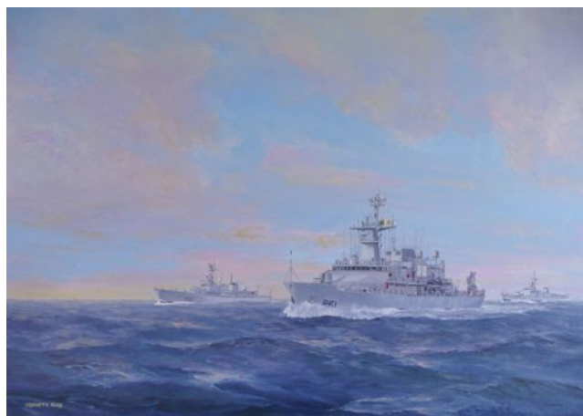
L.E. Samuel Beckett with L.E. Aoife and L.E. Orla Oil on hardboard 30" x 22" Catalogue no: 05.14