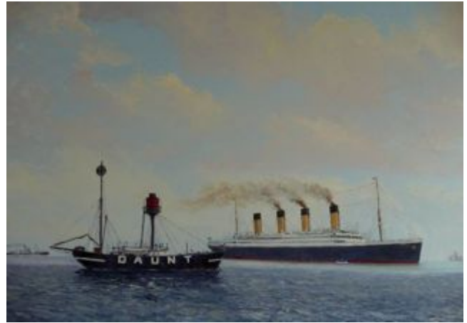
R.M.S. Titanic disembarking pilot off the Daunt Lightvessel, 11th April 1912 Oil on hardboard 28" x 18" Catalogue no: 21.11