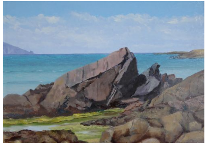
Along the shore near Rosbeg, Co. Donegal Oil on hardboard 16" x 12" Catalogue no: 09.16