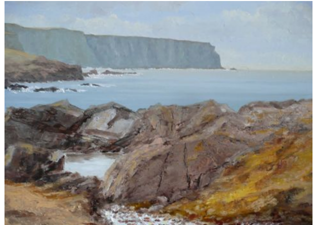
Malinmore Head from Garveross Glencolmcille, Co. Donegal Oil on hardboard 16" x 12" Catalogue no: 05.16